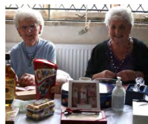
Autumn Club Bring & Buy

hosted and contributed desserts and everybody who supported this event.