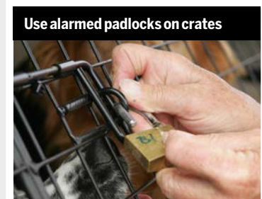
Use alarmed padlocks on crates